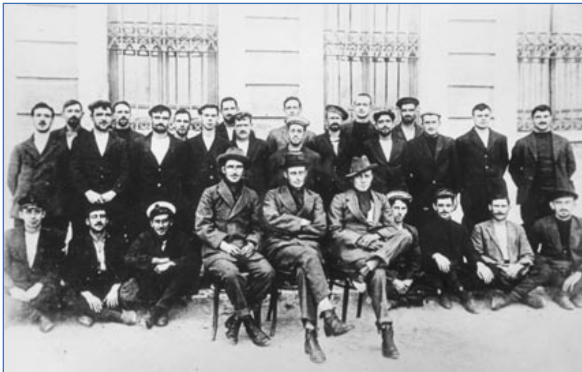
The Crew of HMA Submarine AE2

To assist in the preservation of the Australian World War I submarine HMAS AE2 and to recognize the hitherto unsung heroism of her crew for their exploits in the Dardanelles campaign in 1915. The deeds of the Australian soldiers who fought at Gallipoli have become legend, but the extraordinary story of the Australian sailors who also fought, has yet to be told.